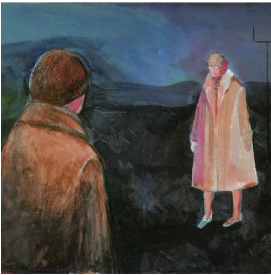
Women at the Bus Stop

The exhibition of some of Ézéquiel Garcia-Romeu's works, in relation to the creation process (drawings, paintings...), can be organized during the shows, depending on the place.