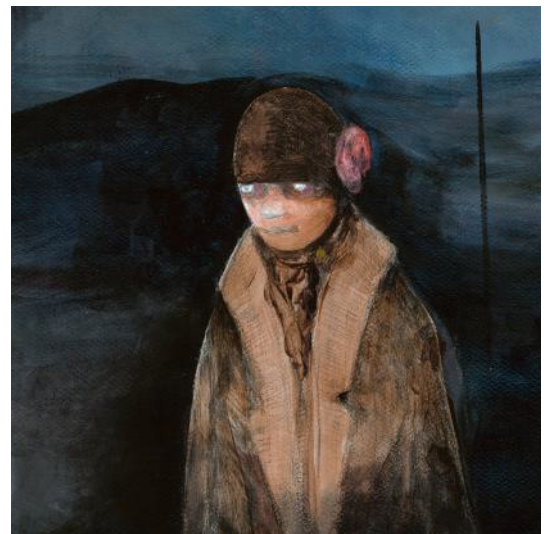
Woman at the Bus Stop